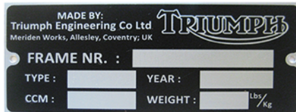
1. VIN Plate

In some instances, where a VIN break is shown against a part (eg, up to a VIN or from a VIN), it will now also be necessary to check for a factory build code to ensure the correct part is selected. The factory build code can be found on the VIN plate for all bikes except those built for America, Taiwan and Canada. For American, Taiwanese and Canadian bikes this detail can be found on a small sticker located above the steering lock. The VIN plate will bear the code 'F2' or 'F4' in its bottom-most field (shown arrowed below). In the case of American, Taiwanese and Canadian bikes, the same 'F2' or 'F4' codes can be found on the small square sticker located above the steering lock.